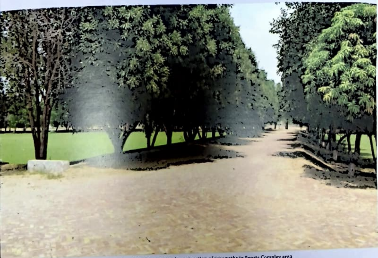
Another view of landscaping and construction of new paths in Sports Complex area