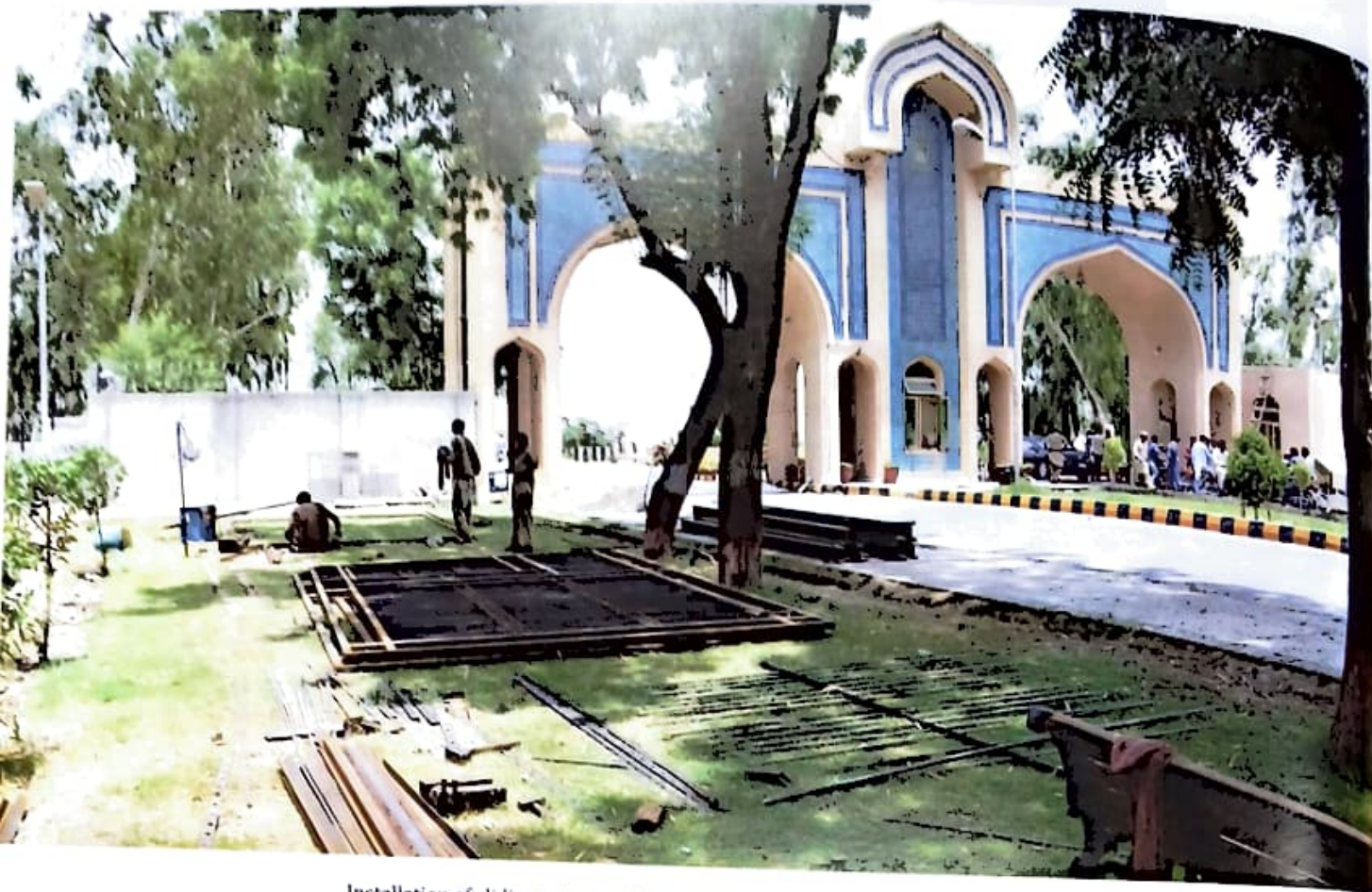
Installation of sliding gate at main entrance of Baghdad ul Jadeed Campus