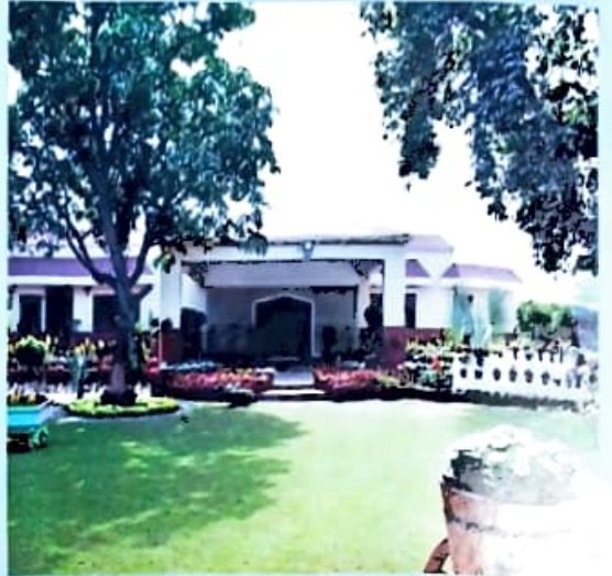
Central Camp House