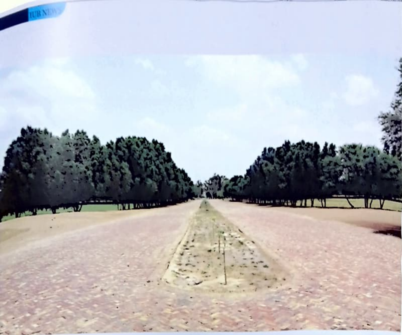
Landscaping and construction of new paths in Sports Complex area