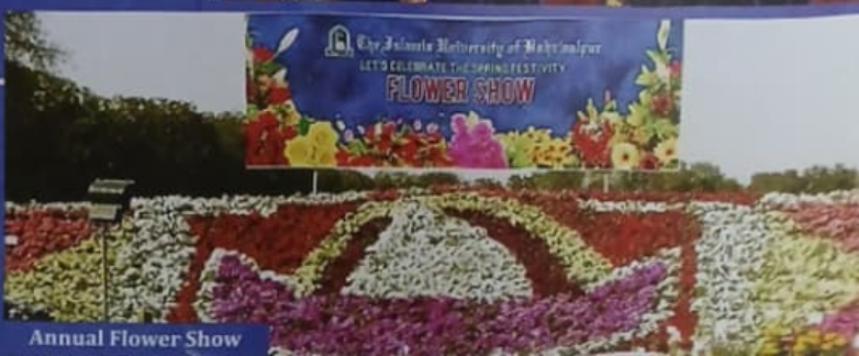
Annual Flower Show