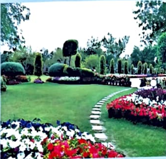
A beautiful lawn at Baghdad-ul-Jadeed Campus