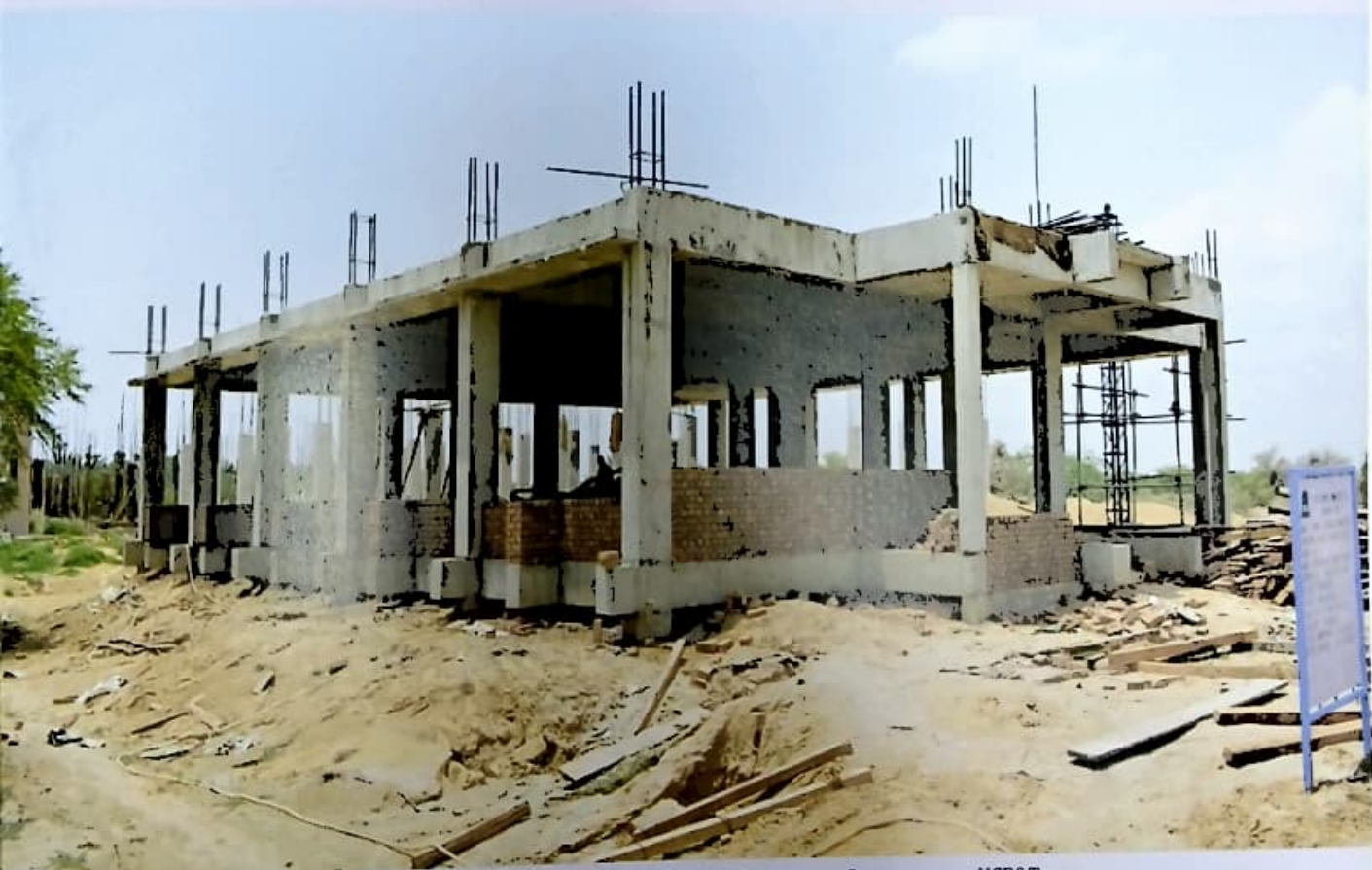
Another view of under construction Civil Engineering Department at UCE&T