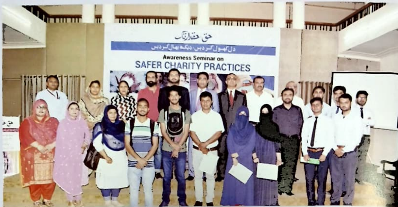
Participants of seminar on Safer Charity Practices