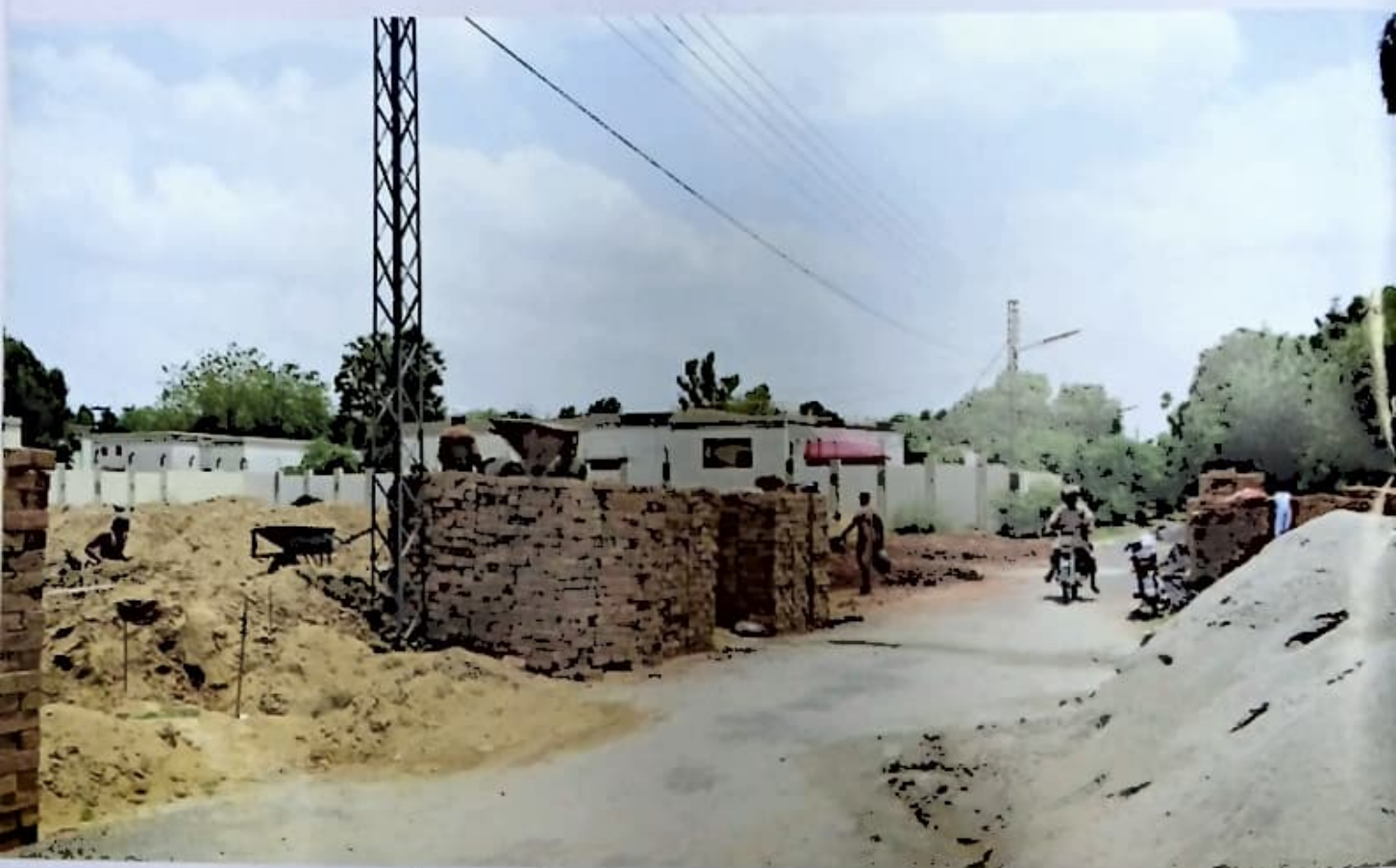
Construction of new housing units at Baghdad ul Jadeed Campus