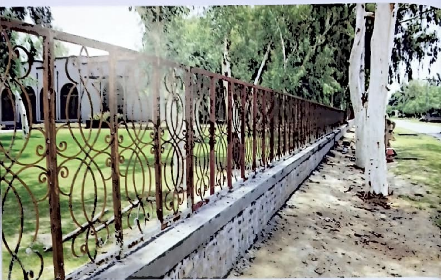
Construction of fence around Vice Chancellor's Office at Baghdad ul Jadeed Campus