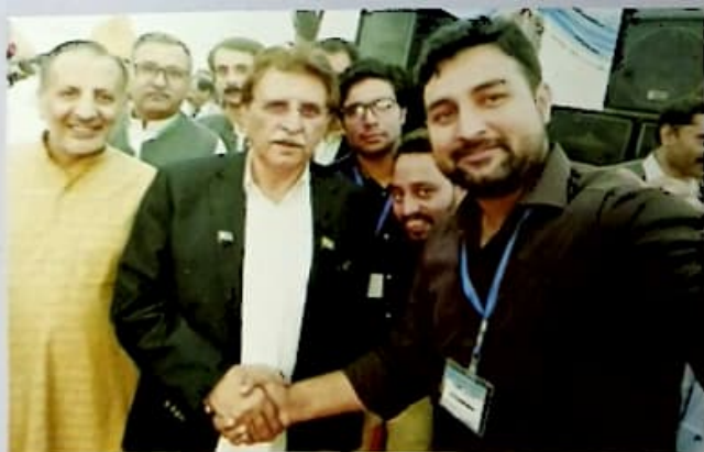
IUB Students along with Raja Farooq Haider Khan, Prime Minister AJ&K

Government of Azad Jammu & Kashmir along with University of Azad Jammu & Kashmir and Higher Education Commission (HEC) expressed the solidarity with Kashmiri brethren on eve of