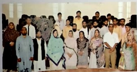
Participants of Naat Competition along with faculty members