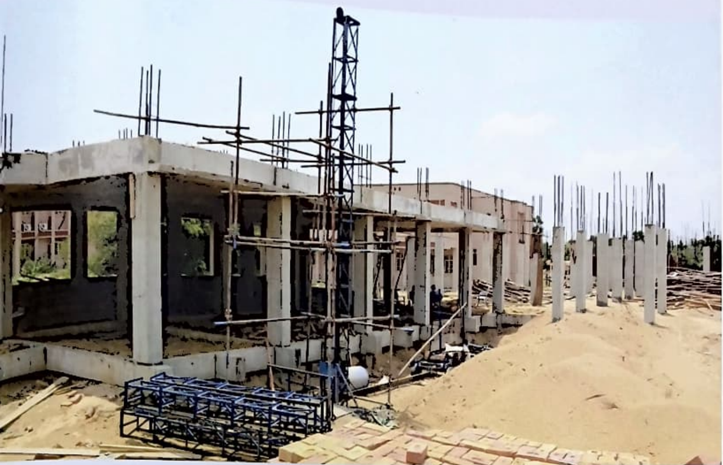
Construction of Civil Engineering Department at University College of Engineering & Technonlgy