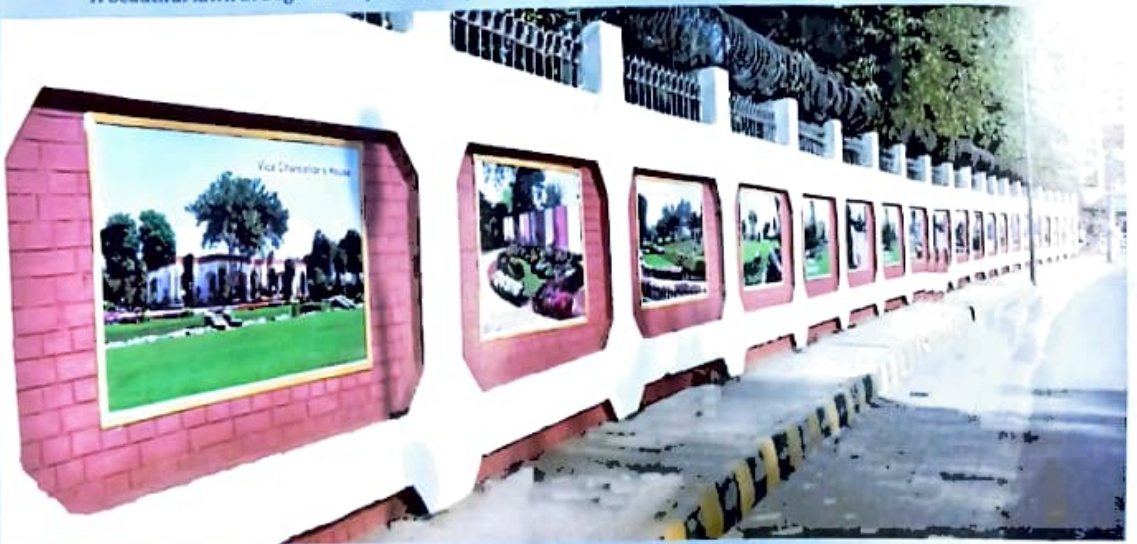
Display of spring festivity on boundary wall of Abbasia Campus