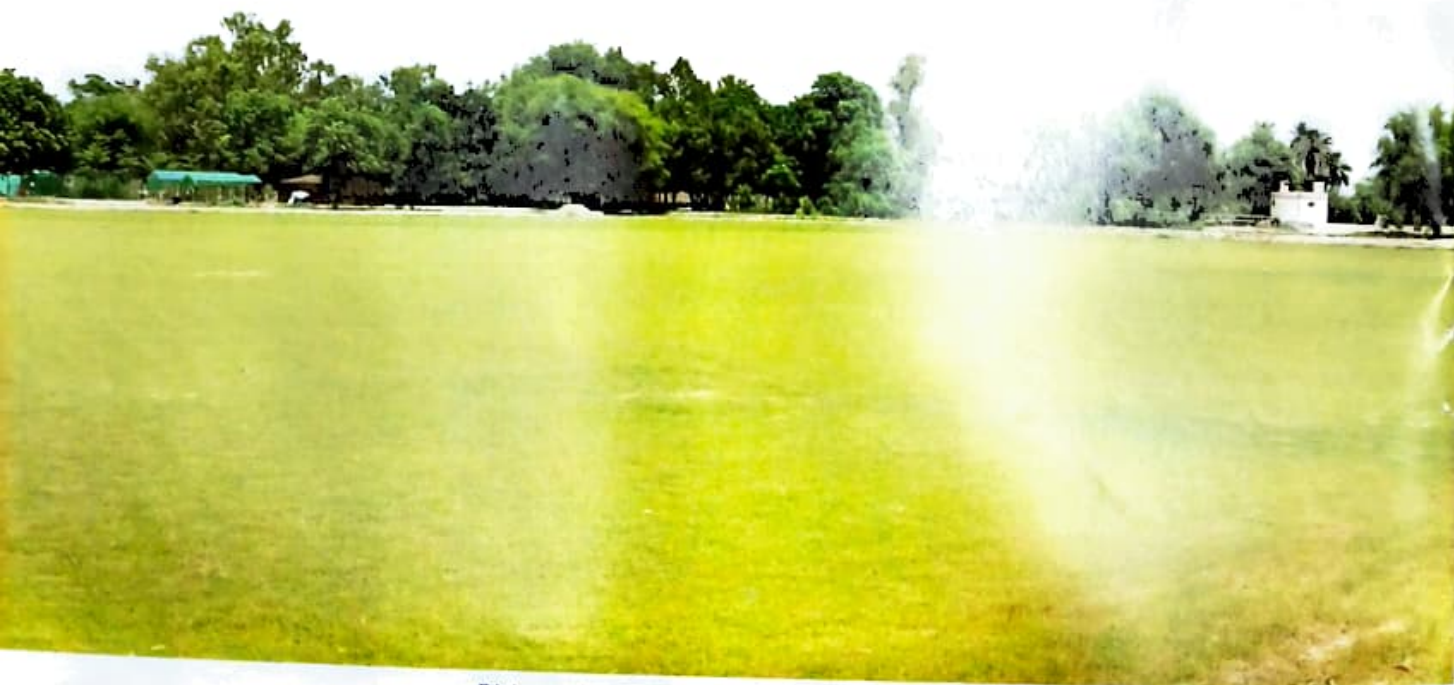
74 Acres of land leveled and converted into lawns