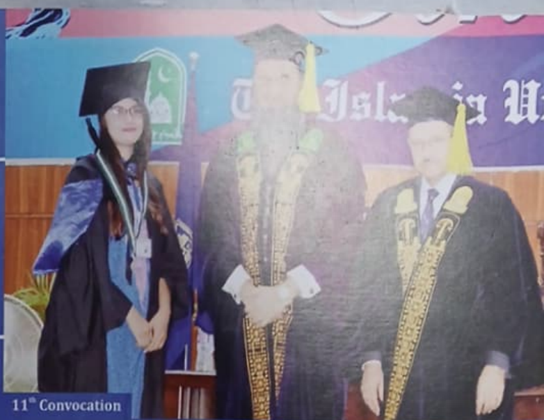
11 th Convocation