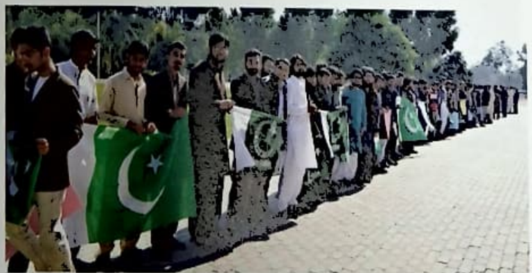
Students expressing solidarity with suppressed Kashmiri people