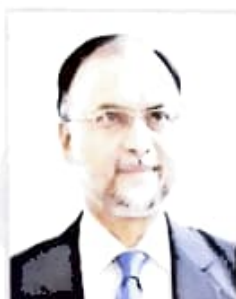
Prof. Dr. Ahsan Iqbal Federal Minister