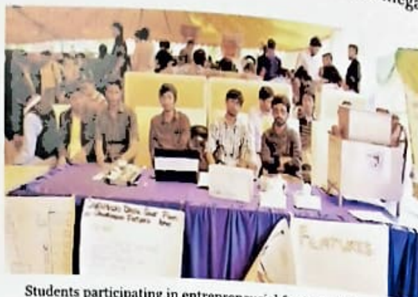
Students participating in entrepreneurial festival at the Islamia University of Bahawalpur

opportunity to show their talent through this mega event.