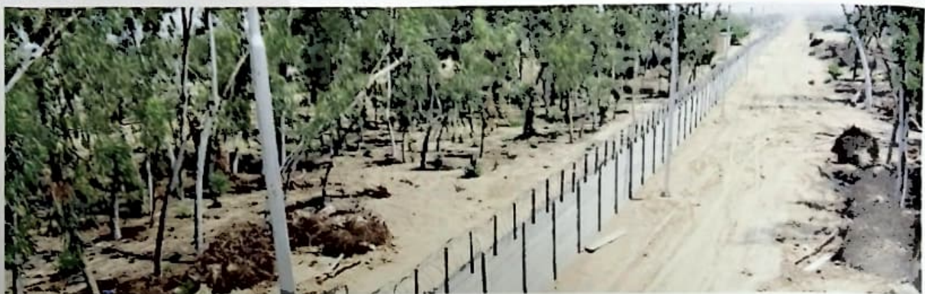
11.8 kilometer long boundary wall equipped with razor cut wire and solar lights completed in record period of 41 days securing Baghdad ul Jadeed Campus