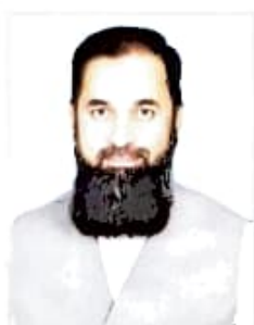
Engr. M. Baligh ur Rehman Minister of State