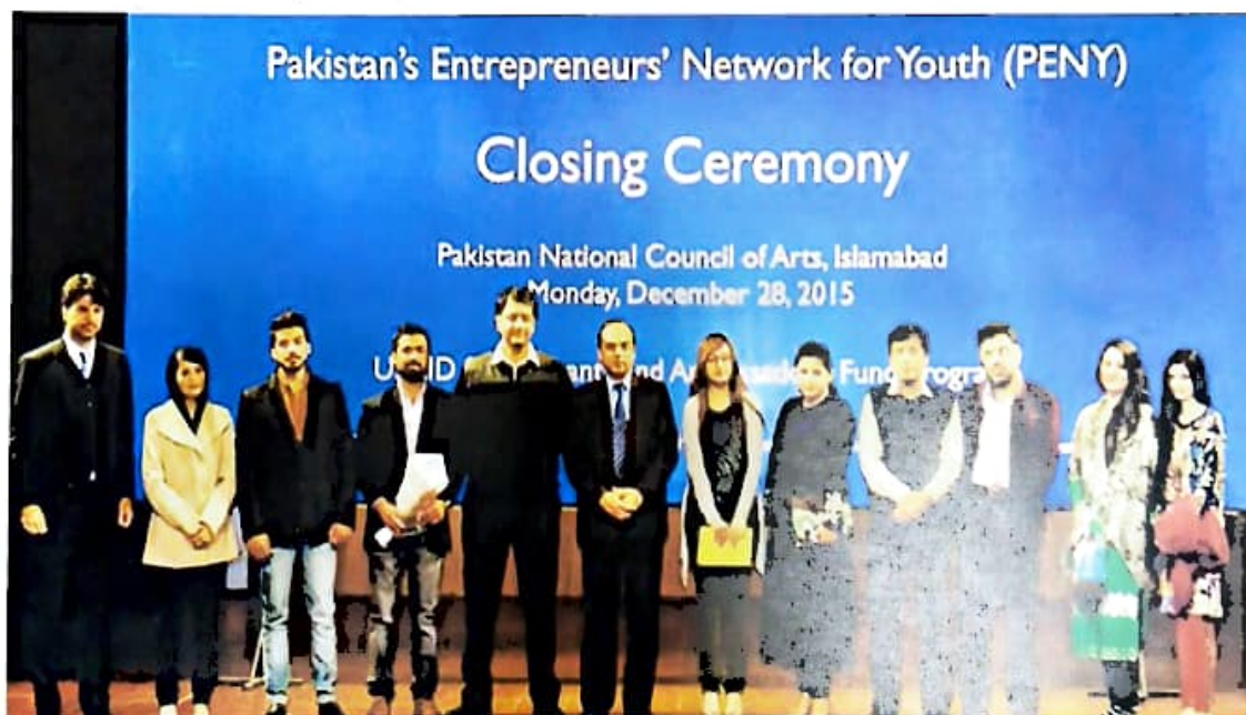
Faculty and students of the Islamia University of Bahawalpur participating in USAID Entrepreneurship Seminar

and internationally. Business profiles of renowned entrepreneurs around the globe were also discussed. The students were advised to start business on small scale instead of wasting their energies in search of jobs.