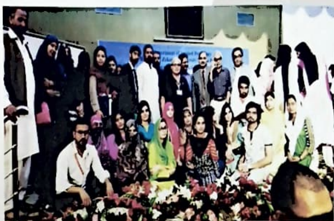
Group photo of participants at the International Applied Psychological Conference