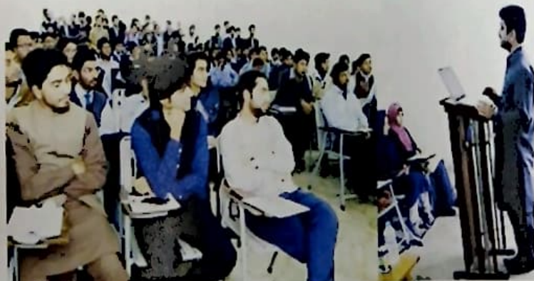
Seminar on Career Counseling