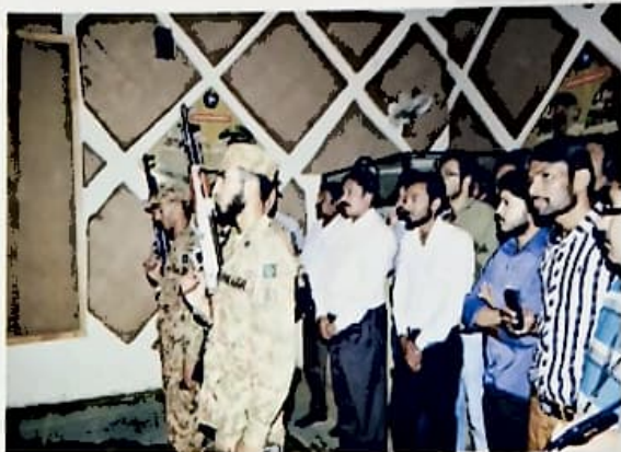
The University students visiting a training camp of Pak Army