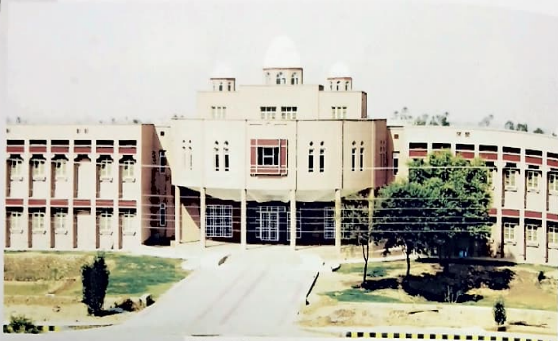
University College of Engineering & Technology

students thanked the Vice Chancellor for his efforts to achieve this success.