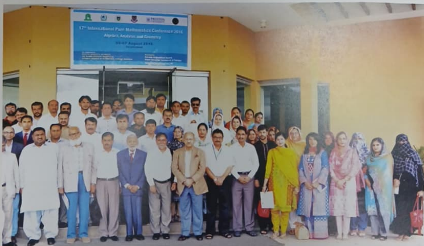
Group photo of participants of IPMC 2016