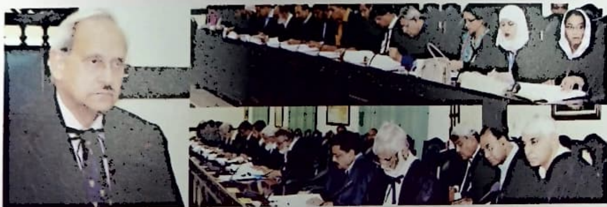
Participants of the Academic Council

recognition of our degrees at the national and international level. Academia and administration both are responsible for enforcement of academic rules and standards. The academic council considered to introduce 5 year LLB programme and approved amended syllabi of various MPhil and PhD programmes.