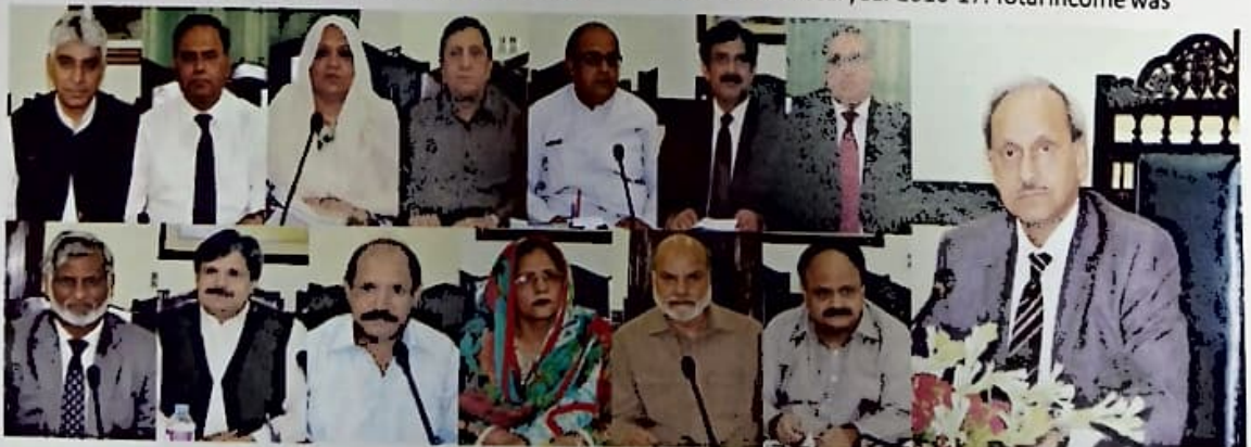
63 rd meeting of the Syndicate