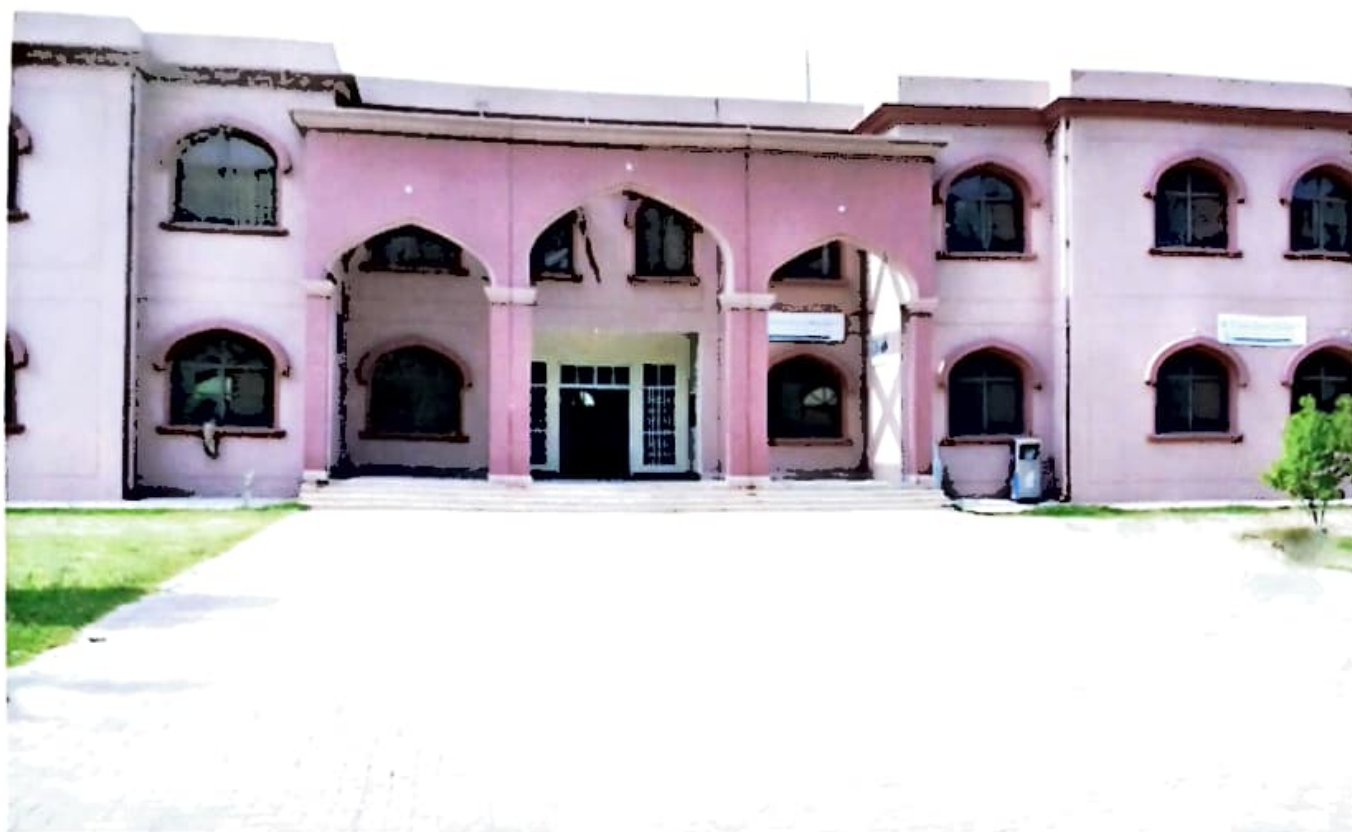
Department of Management Sciences shifted to upgraded building in Baghdad ul Jadeed Campus