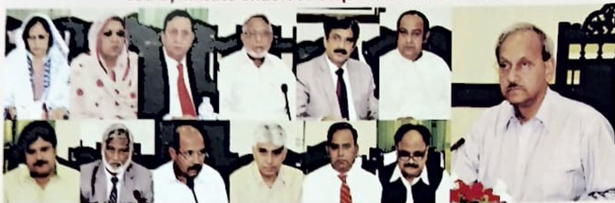
62 nd Meeting of the Syndicate