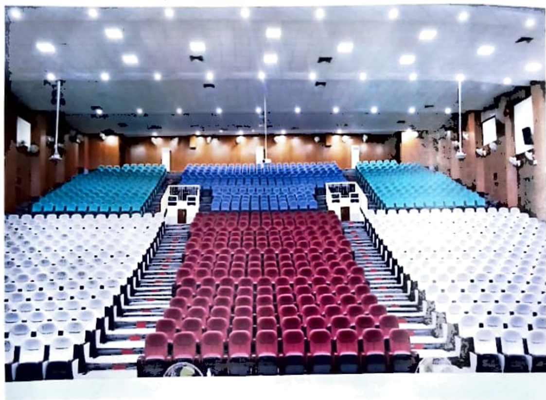
A view of the newly renovated main auditorium at Baghdad-ul-Jadeed Campus