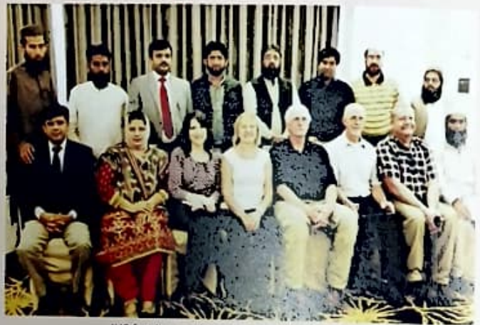
IUB faculty members along with foreign experts during training workshop in Malaysia

Thirteen faculty members of University College of Veterinary & Animal Sciences, the Islamia University of Bahawalpur attended a 5-day hands-on training workshop on "Isolation and Quarantine Response Strategies for Biological Disease Outbreak" at Kuala Lumpur, Malaysia. The training was sponsored and organized by Center for Agriculture, Food Security & Preparedness and Institute of Agriculture, University of Tennessee USA. The participants were apprised of zoonotic diseases associated with domestic animals and wildlife that pose a threat to human communities. The training will help the participants to handle and control major epidemics in the communities of Cholistan desert of Bahawalpur.