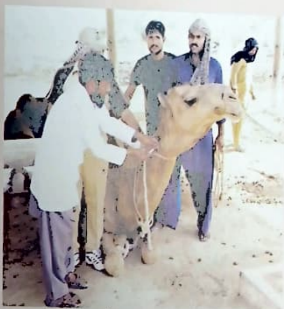
IUB veterinary team providing medical treatment to a camel in desert area