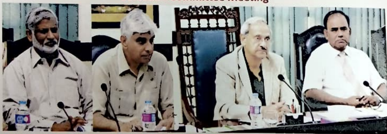
A view of selection committee meeting