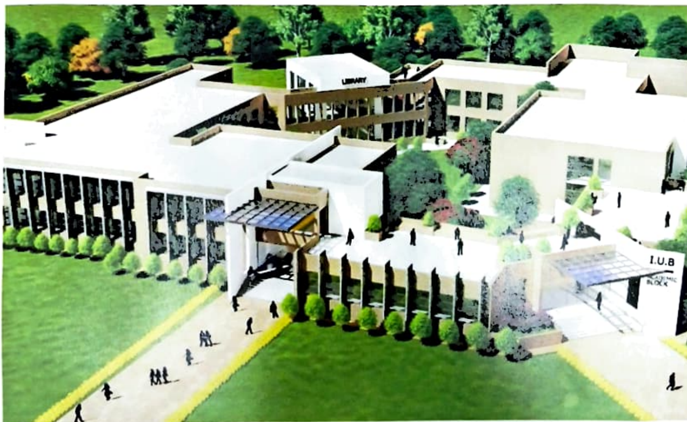
The future academic block of Department of Management Sciences, another state of the art building going to be completed at Baghdad ul Jadeed Campus very soon under a project of Government of Pakistan worth Rs. 860 million