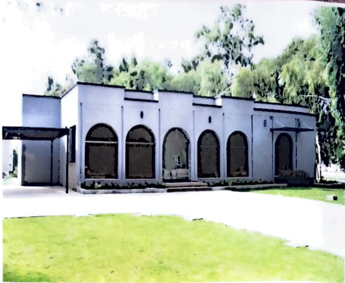
Newly constructed office of the Vice Chancellor at Baghdad-ul-Jadeed Campus