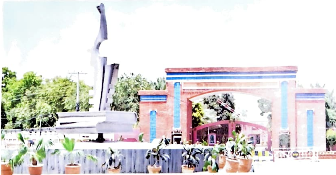
A view of Knowledge Monument in front of Abbasia Campus