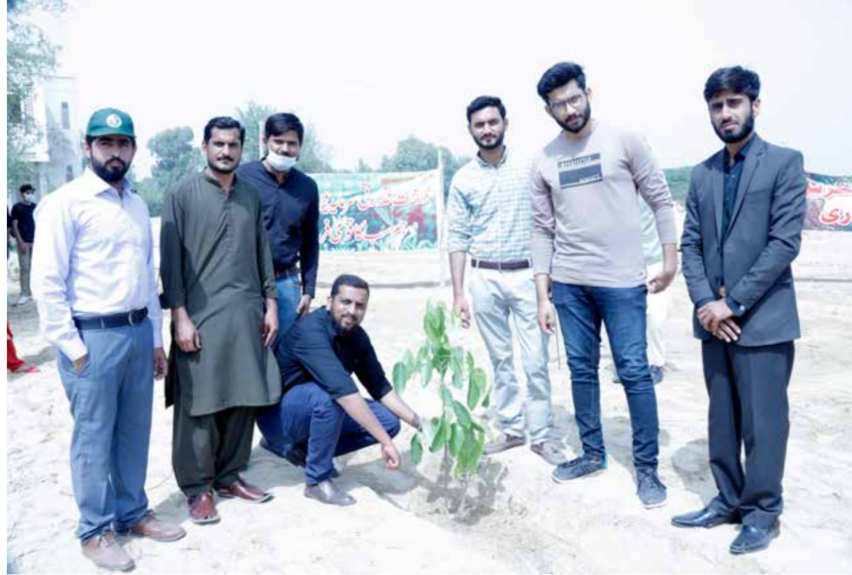
Students participating in tree plantation on International Day of Forests