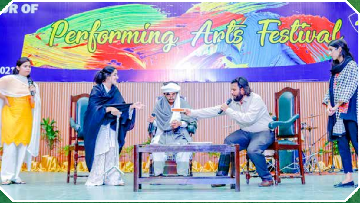
Performing Arts Festival 2021