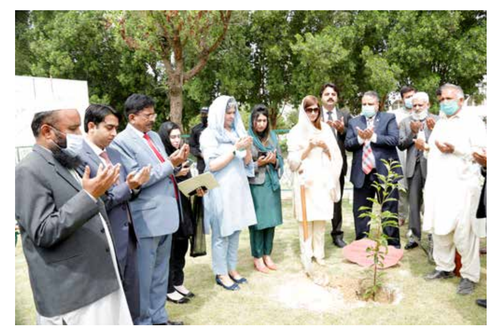
Visit of Hakra Art Gallery and tree plantation by the honourable Minister of State

Scottish Scholarships by the British Council. "Our women are second to none in the world in terms of their talent and are performing at their best in every field," she said. She advised the students to focus on education, character building and