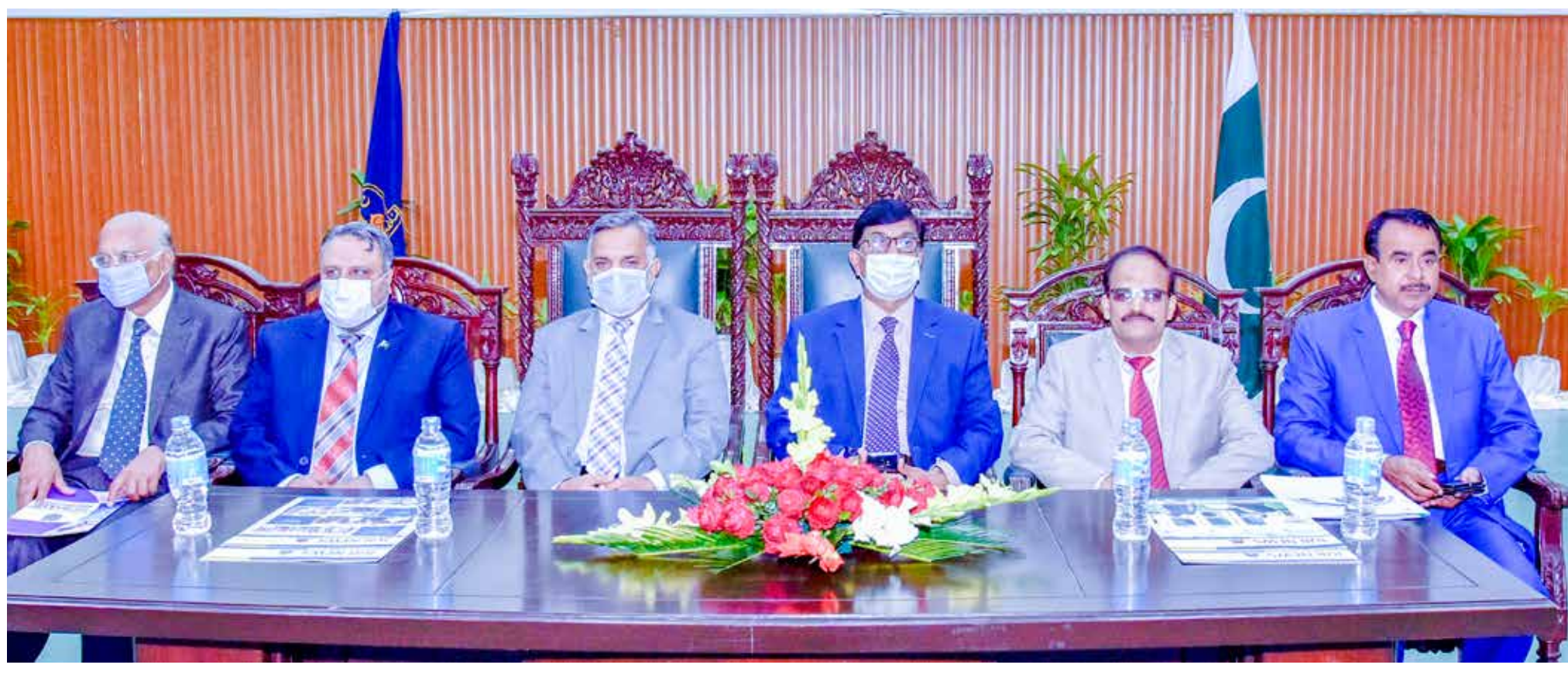
A view of consultative workshop on National Education Policy 2021

from our research and the education policy should actually be formulated by the practitioners. There should be technology based education policy and in this regard obstacles should be removed. Urdu translations of modern sciences