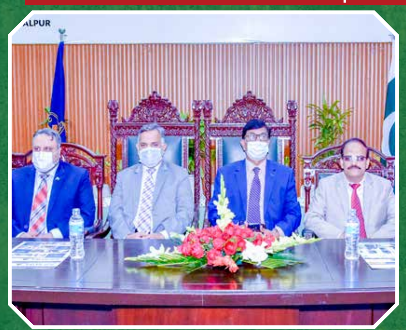
Consultative Workshop on National Education Policy 2021