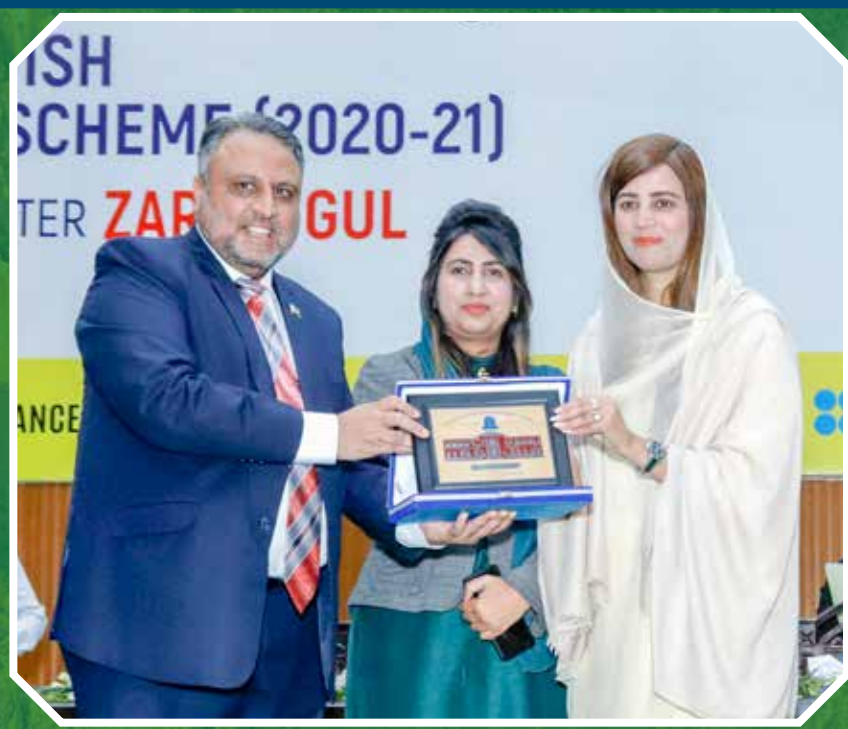
Federal Minister of State Zartaj Gul visits IUB