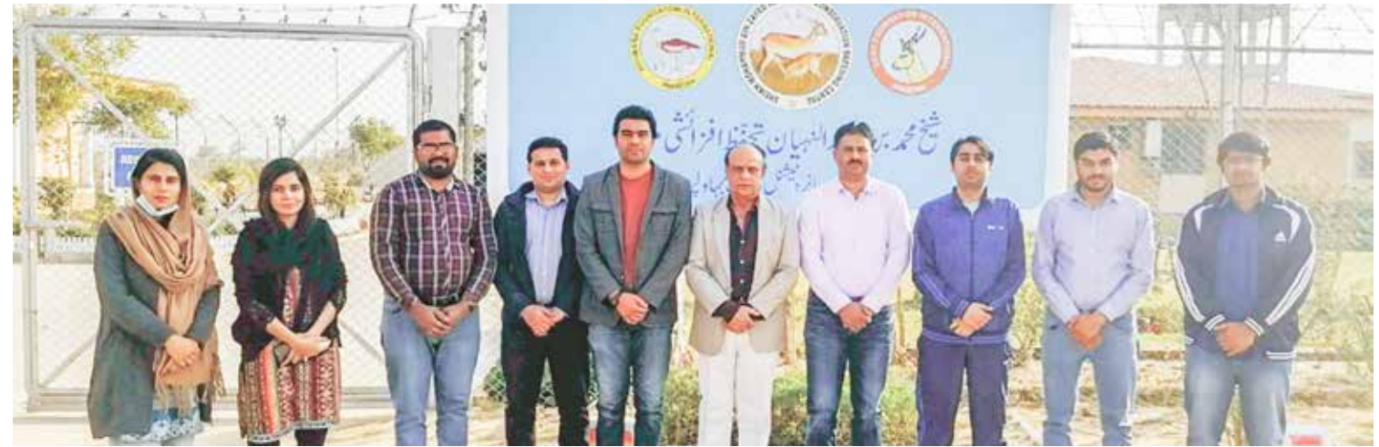
Faculty members visiting Houbara Foundation's Center in Cholistan Desert

A team of Soil Microbiologists from Department of Soil Science, the