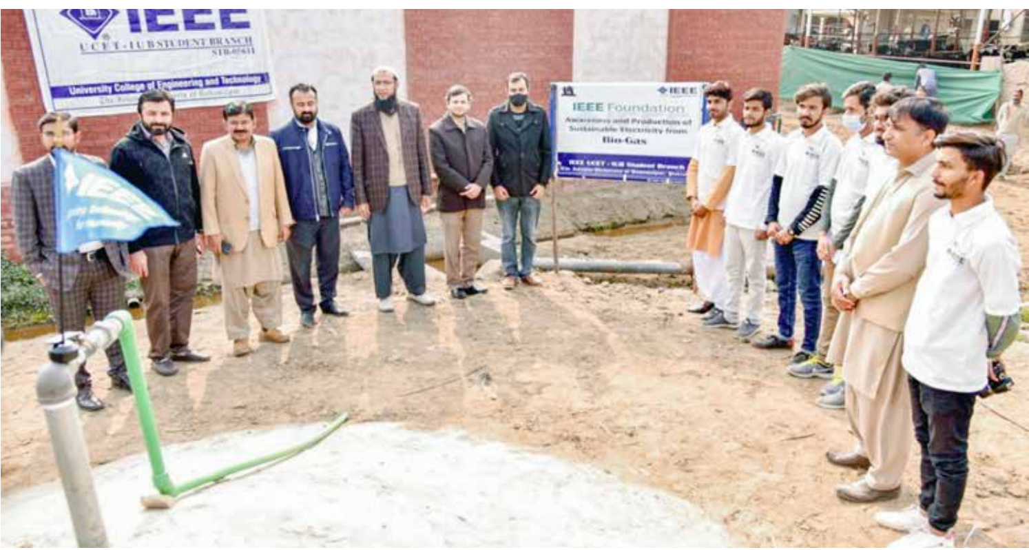
A group photo of IUB delegation at biogas plant in Uch Sharif

The IEEE, the Islamia University of Bahawalpur Branch in collaboration with the IEEE Foundation worked on a clean and green energy project using Animal waste. A biogas plant has been constructed in a village near Uch Sharif. The produced gas is used for electricity generation and household usage. A 12 KVA generator is also installed at the site which is also funded by IEEE. The project achieves awareness of green and clean energy to the local community, production of clean and green energy, efficient decomposition of animal waste which otherwise is harmful for the environment production of super fertilizer. Talking with media, Engr. Prof. Dr. Athar Mahboob, Vice Chancellor, the Islamia University of Bahawalpur said that the electricity through biogas is not a new idea and a lot of work has been done around the globe on this technology. However, being a third world country, this renewable technology has not much flourished in Pakistan. It is only used for running stoves on very low scale and a very small community is taking benefits from it. Being an agricultural country, where 70% of the population belongs to the rural area, this renewable