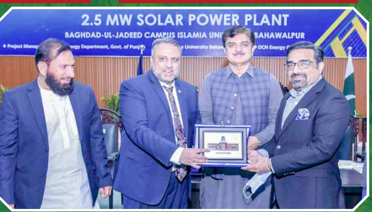
Ground Breaking Ceremony of 2.5 MW Solar Park at IUB