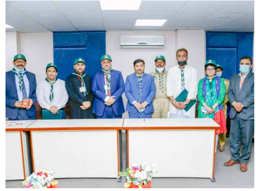
Glimpses of MoU signing ceremony between IUB and Pakistan Boys Scouts Association