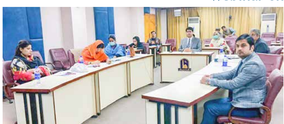
Participants of webinar on E-Governance

In continuation of its webinar series, the Department of Political Science at the Islamia University of Bahawalpur organized a webinar session on the Role of E-Governance