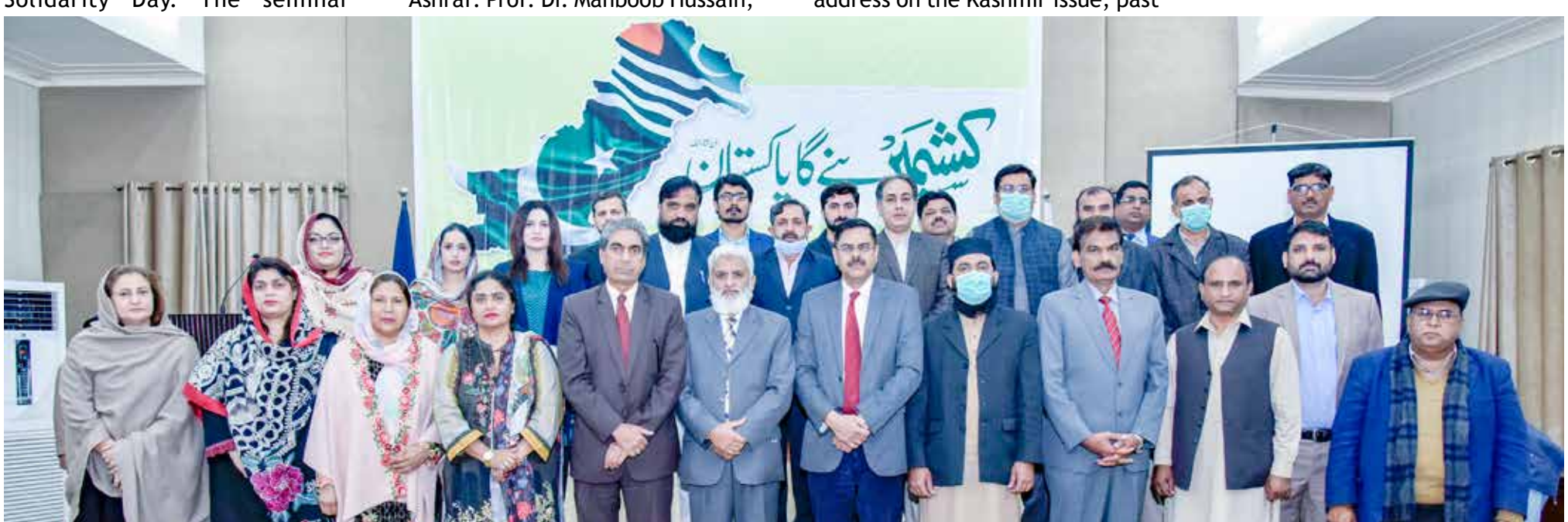
Group photo of participants of seminar on Kashmir Solidarity Day

and present. The participants said that Kashmir is a global issue and a challenge to world peace. The independence movement is purely an internal movement of Kashmiris which consists of years of eternal sacrifices. The right to selfdetermination is a fundamental right of Kashmiris which has been recognized by the United Nations platform and is still a global issue. The present Hurriyat movement is unique from all the movements of the past and full of the spirit of freedom which the young Kashmiris are running with their sacrifices and have attracted the whole world. Pakistan has always provided moral and political support to the oppressed Kashmiris and raised its voice for them on every platform in the world. This issue is currently the focus of global attention and the United Nations