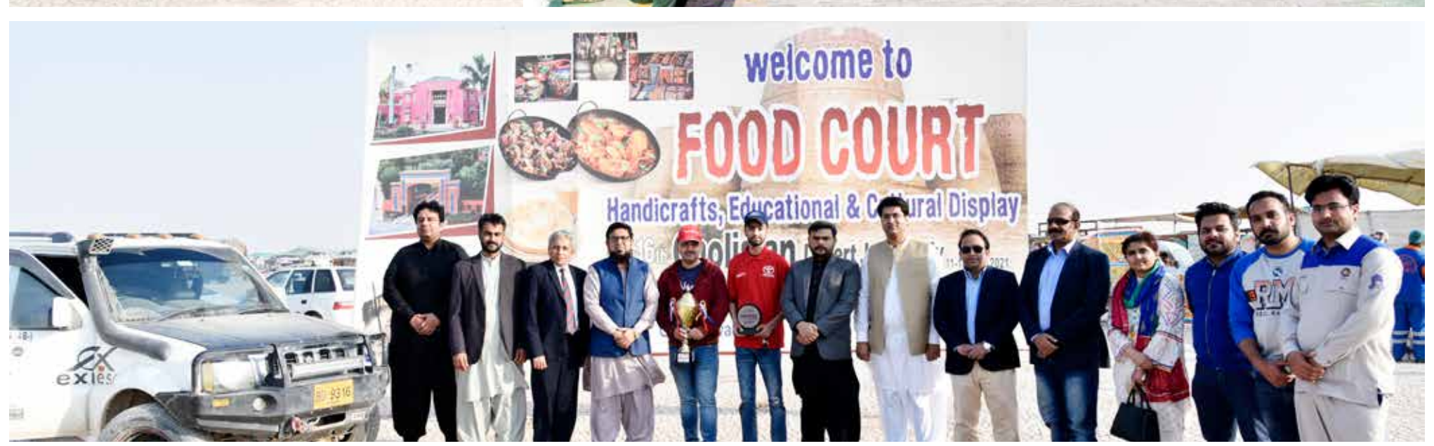
Glimpses of IUB participation in Bahawalpur Trade Fair and Cholistan Desert Jeep Rally