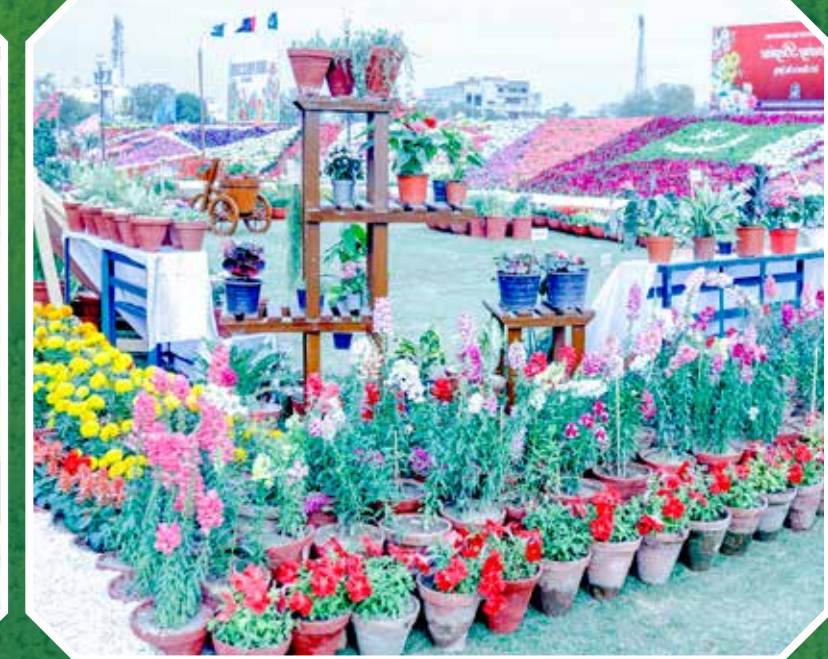
University Flower Display at Noor Mahel