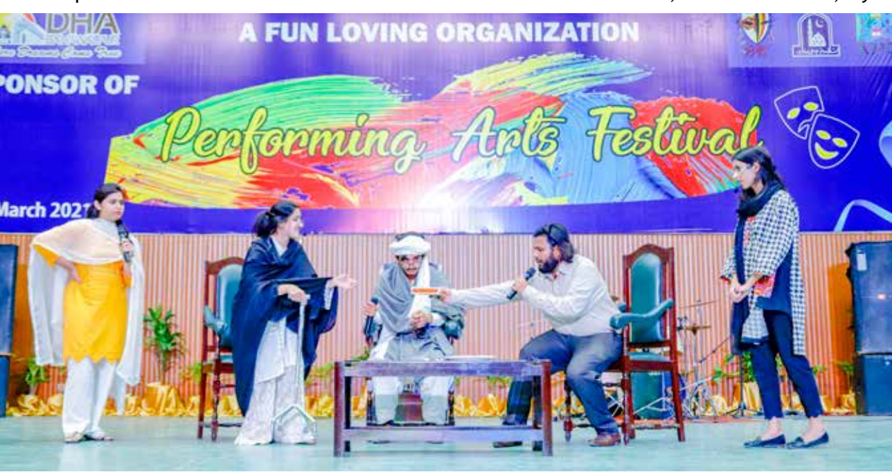
Glimpses of Performing Arts Festival 2021