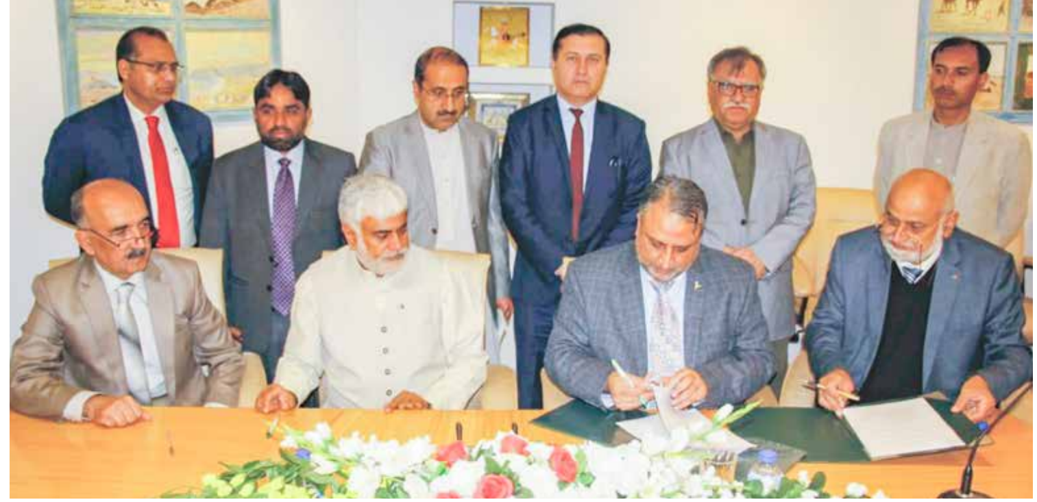
A view of MoU signing ceremony

A memorandum of understanding was signed between the Islamia University of Bahawalpur and University of Balochistan, Quetta