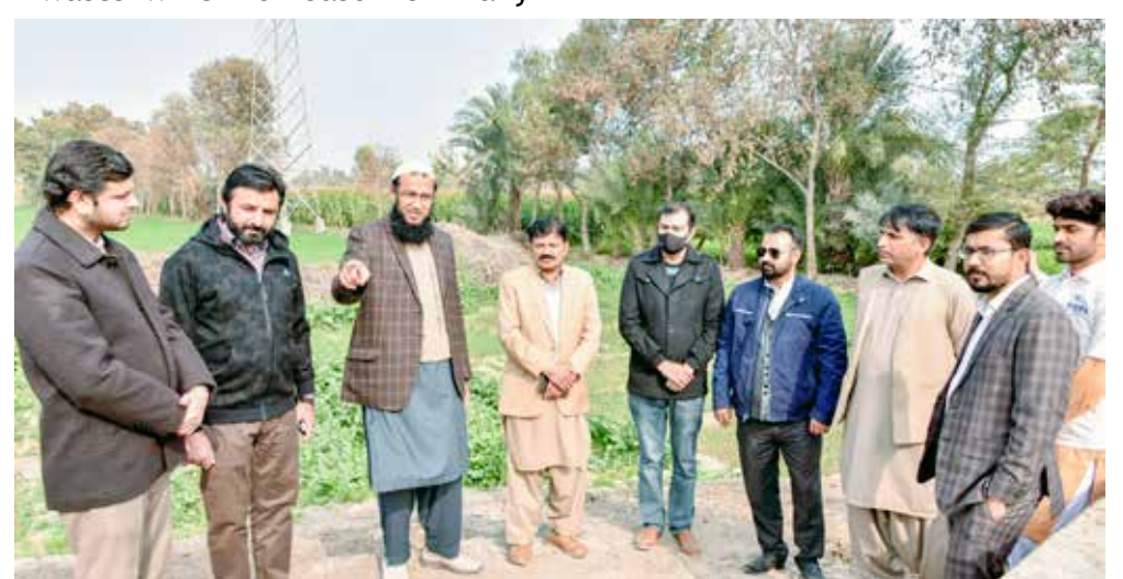
Faculty members and students visiting the biogas plant near Uch Sharif