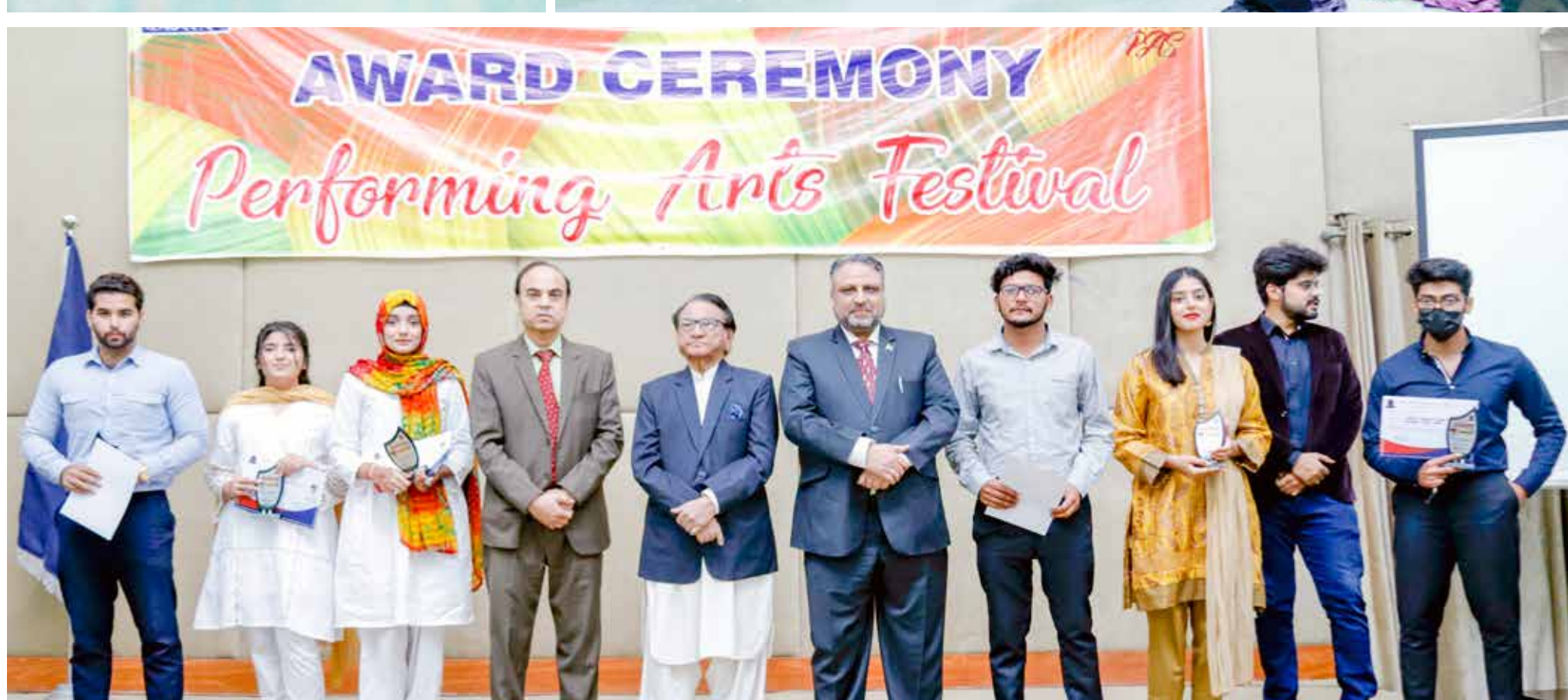
Glimpses of Performing Arts Festival 2021