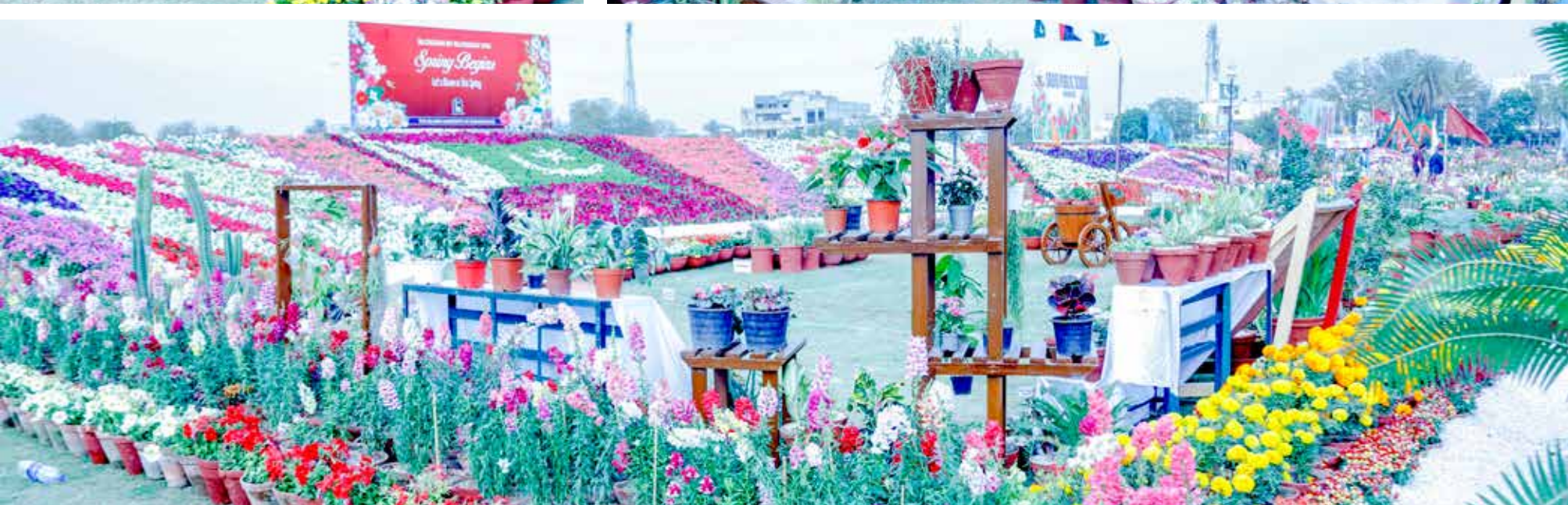
Glimpses of IUB flower display at university campuses and Noor Mahel