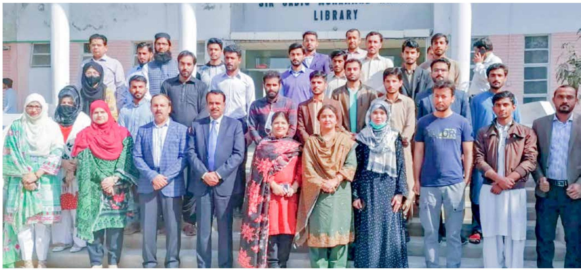
Participants of seminar on International Day of Human Fraternity

for the acceptance of societal diversity, inclusion and respect for other religions and their cultural views. The schools play a significant role to raise the awareness, promote tolerance and eliminate the discrimination based on religion or cultural beliefs.