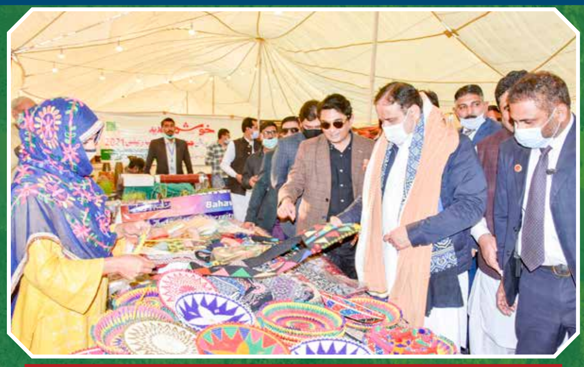
Honourable Chief Minister Punjab visits IUB stalls at Bahawalpur Trade Fair