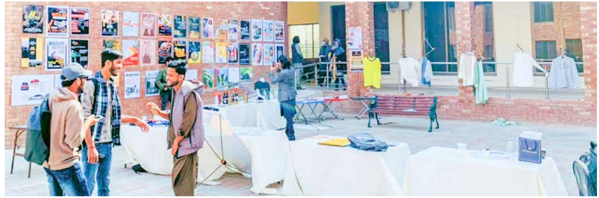
Faculty members and students visiting the Exhibition 2021