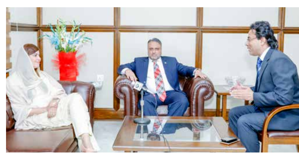
A view of panel discussion with Radio Pakistan