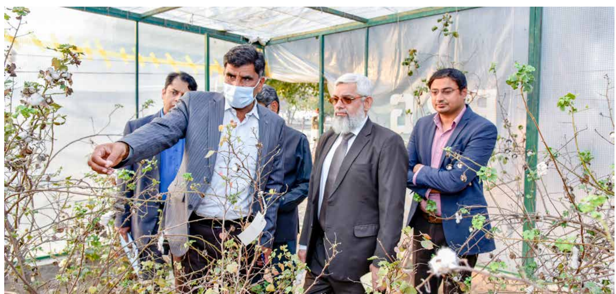
A visit of IUB cotton varieties grown in glass house

also suggested different options for commercialization of research products.