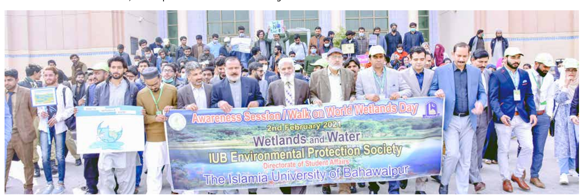
Participants of a walk on World Wetlands Day

fresh water shortages. Individual and collective efforts will have to be made to prevent water loss.