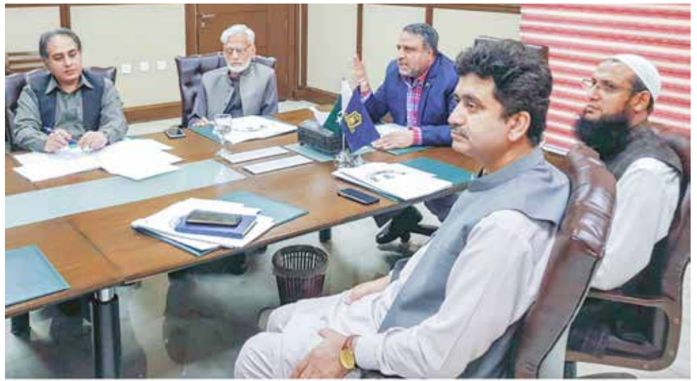
A View of the online meeting of the Federal Ministry of Planning and Development for the approval development projects for Islamia University Bahawalpur

An online meeting was held under the chairmanship of Member Science and Technology, the Ministry of Planning, Development and Special Initiatives which cleared the concept paper of the development projects proposed by the Islamia University of Bahawalpur worth Rs. 4.5 Billion. This project envisages establishing a sub campus of the University at Ahmadpur East, strengthening of Bahawalnagar sub campus and establishing Mechanical Engineering Department, Institute of Physics and Institute of Agro-Industry and Environment at the