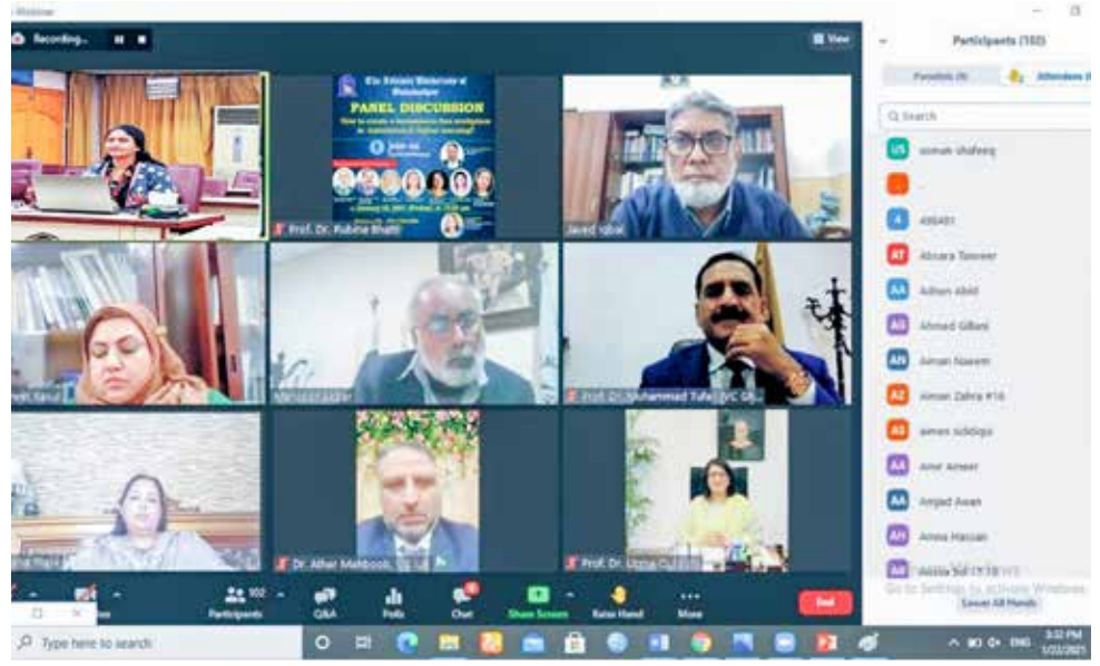
A view of panel discussion on harassment free workplace institutions

equality within the campus. The distinguished panelist shared their insights on the issue and said that workplace harassment is an epidemic throughout global higher education systems and affect individuals, groups and entire institutions colossally. Workplace Harassment is unacceptable, everyone has a right to have a safe workplace with dignity. We must have a Zero tolerance for all forms of workplace harassment. The discussion concludes that workplace harassment is an advanced form of disrespect. It is the responsibility of every individual to respect the differences among colleagues at the workplace. In a way, we will be able to develop and promote an