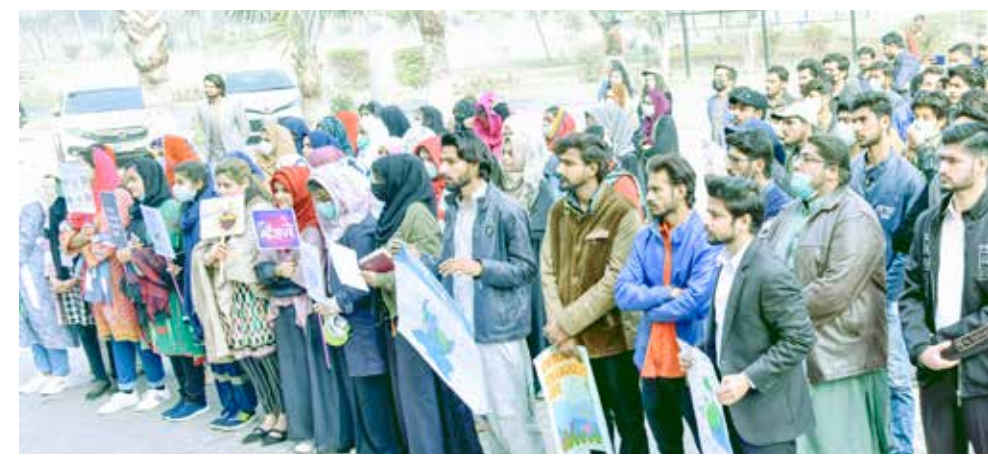
Students organized a walk on World Wetlands Day

Scientific and Cultural Organization (UNESCO) celebrate this day every year. This year the theme of the day is Watersheds and Water. The speakers said that water bodies are a great source of fresh water. The Islamia University of Bahawalpur is playing a significant role in the protection of the environment, especially the Cholistani life, flora and fauna and birds. Research on Cholistani wetlands is also underway. Over time, population growth has led to increased environmental imbalances, which have also affected wetlands. There is a need to prevent further depletion of natural life-sustaining