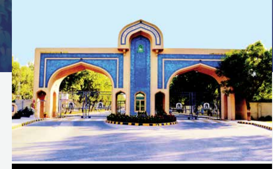
Baghdad ul Jadeed Campus